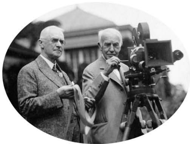
George Eastman (left) & Thomas Edison with movie camera

PHOTO KODAK PATENT X-RAY EDISON FILM DIGITAL PRINT