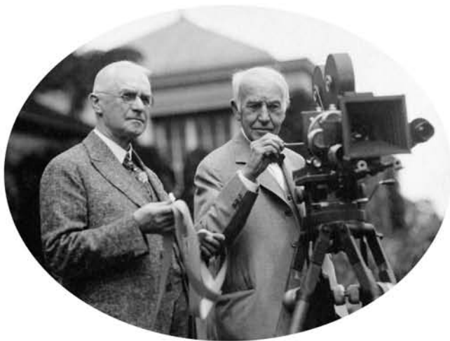
George Eastman (left) & Thomas Edison with movie camera

N T K J E D I S O N E O P H I R X O M O G A X R A Y T A E L T N E T A P S U A A N O M E G L Q P S T I I K O D A K H T I R S P Z P T X O M G P L M O X E O T A I Y U L R J S T O N D X M I N V E N T O R T E F Z C Y A B Q W A I R A M K C A L B