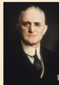
Unidentified Photographer, 1914. Early two-color Kodachrome of George Eastman

Standard 1: Students will read write speak and listen for information and understanding. Standard 2: Students will read write speak and listen for literary response and expression. Standard 3: Students will read, write speak and listen for critical analysis and evaluation.