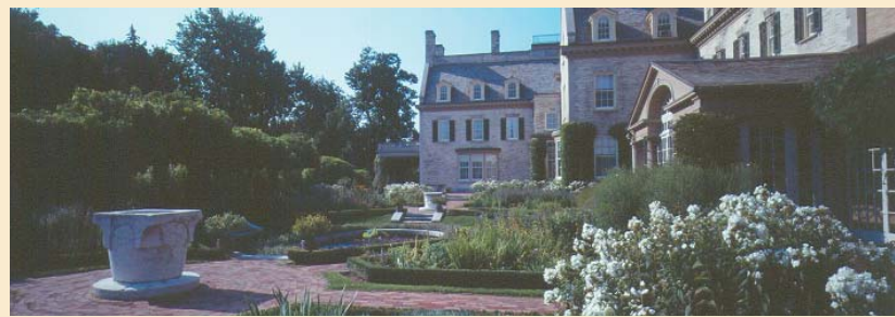
George Eastman House and terrace garden, 2004.

George Eastman's diverse and generous contributions, from establishing the area's largest employer, Eastman Kodak Co., to supporting hundreds of charities and founding numerous organizations. The reality is that although Mr. Eastman had a big heart, he also had a keen business sense. And he knew that in order to attract educated scientists and business leaders to Kodak, he needed to help create a vibrant community. And that's just what he did, with Rochester receiving the bulk of the $100 million in charitable funds he donated during his lifetime (close to $2 billion in today's dollars). Eastman set a stage in Rochester for a solid health care system and established parks, elevated education, and surrounded residents with music and art. Organizations that Eastman either founded or funded including the United Way, American Red Cross, University of Rochester, Memorial Art Gallery, Rochester Philharmonic Orchestra, and the Rochester Dental Dispensary