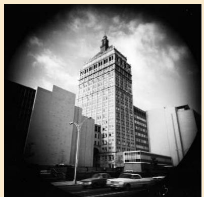
Eastman Kodak Company Headquarters, photographed with a 1888 No. 1 Kodak camera.

“ There always is something more to do... No one should stand still. ”