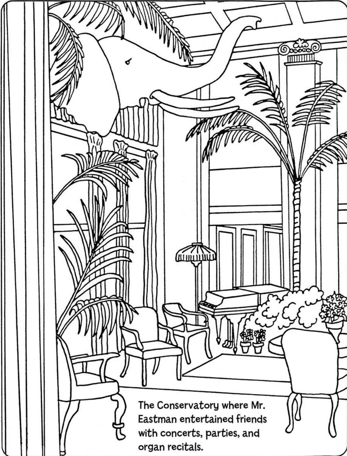
The Conservatory where Mr. Eastman entertained friends with concerts, parties, and organ recitals.